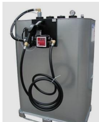
Non contractual picture