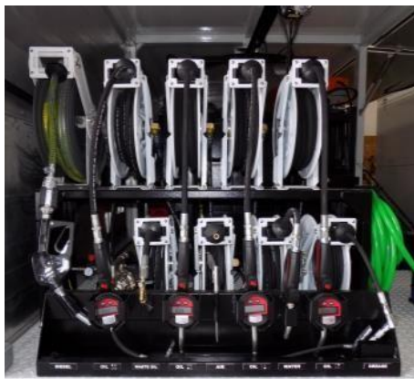
*Example of hose reel support