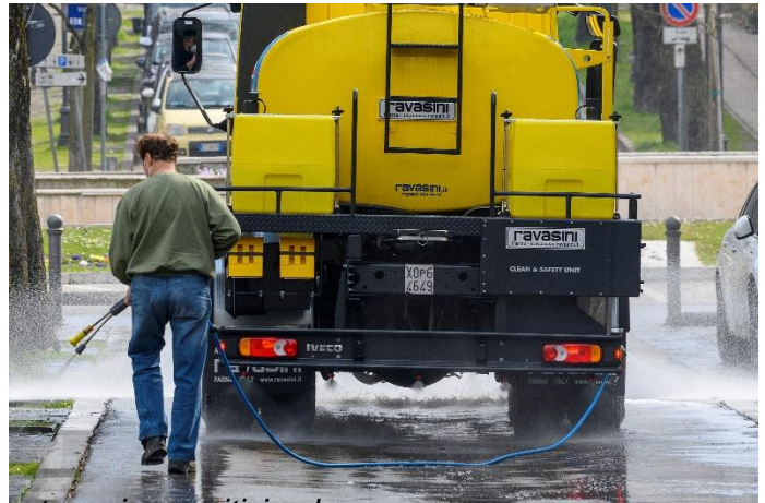
hose-reels compartment and the operator using sanitizing lance

The hose reels enable the operator to carry-out accurate and precise tasks. The hoses are placed on the right end of the truck: