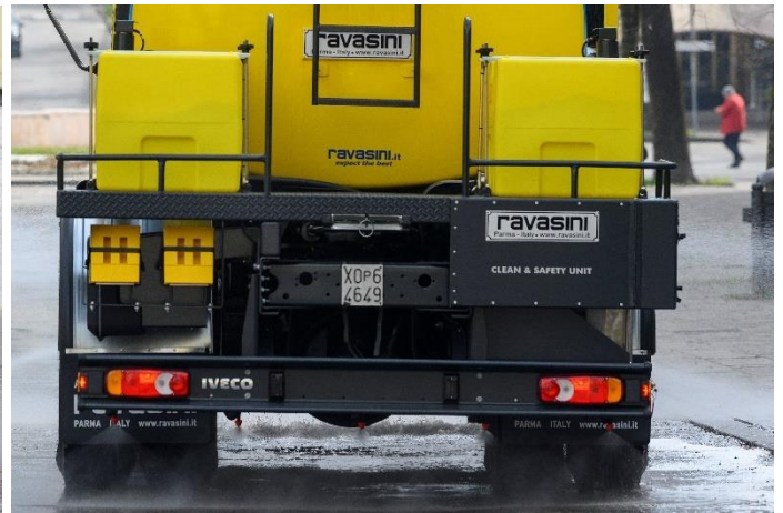
Detail showing front bars and rear bar at work