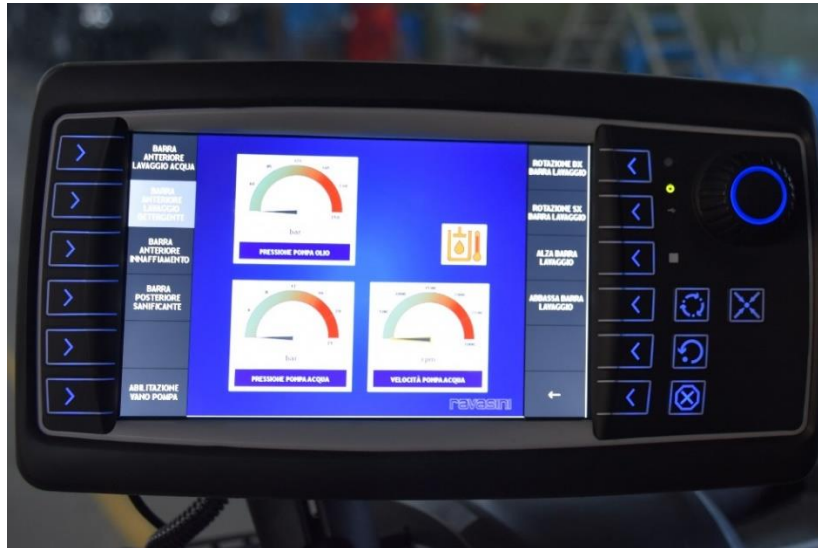
Digital display installed in the driver's cab

Controls placed on the screen sides enable: