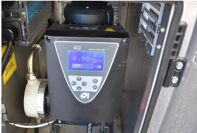
Detail showing the dosing pump for water-sanitizer mixture

Two tanks are positioned on the rear end of the truck for storing and transporting of the concentrated neutral detergent and of the sanitizer. A Venturi mixer, with electropneumatic control, enables the addition of neutral detergent to the front bar to increase the cleaning efficiency. The sanitizer is mixed with water by an electronically controlled dosing pump.