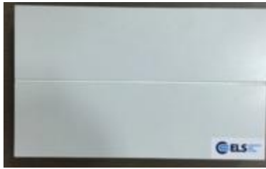
Side panels and rood