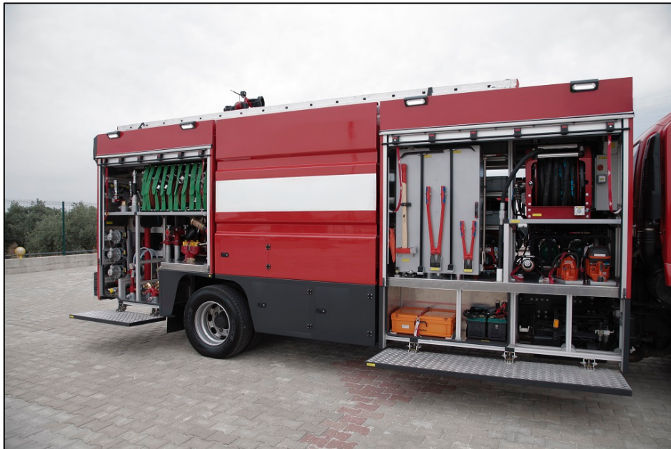
*sample photo for equipment and accesories storage in our units. Our product may differ , it is just for realization.