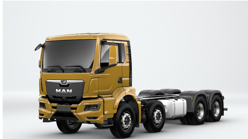
Illustration can deviate