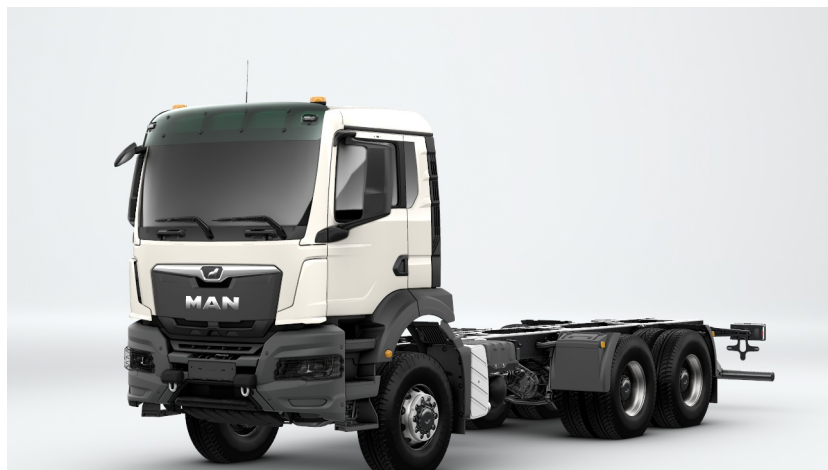
Illustration can deviate