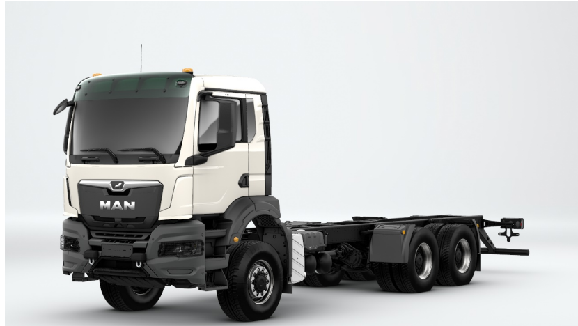
Illustration can deviate